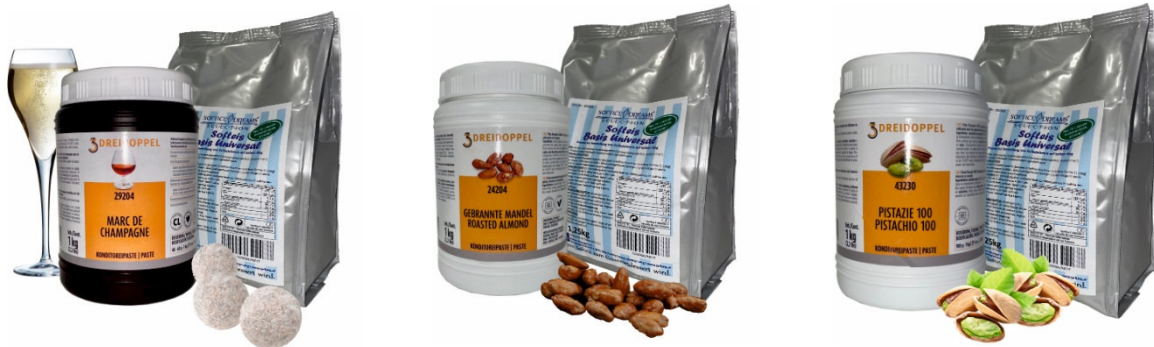
Marc de Champagne Kit Mandorla tostata Kit Exclusive Pistachio Kit

With these new flavours, you can present your customers a range innovative soft ice cream creations at the very highest level of quality and taste.